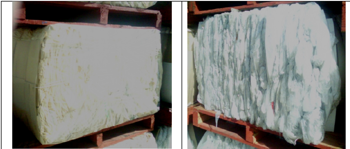
Waste paper and film are collected for recycling