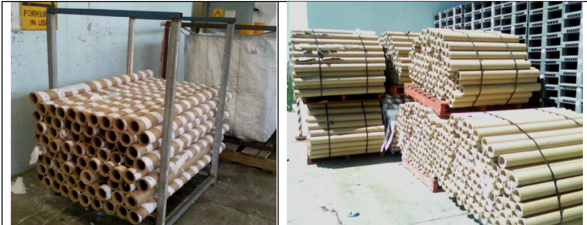
Cores are collected for recycling