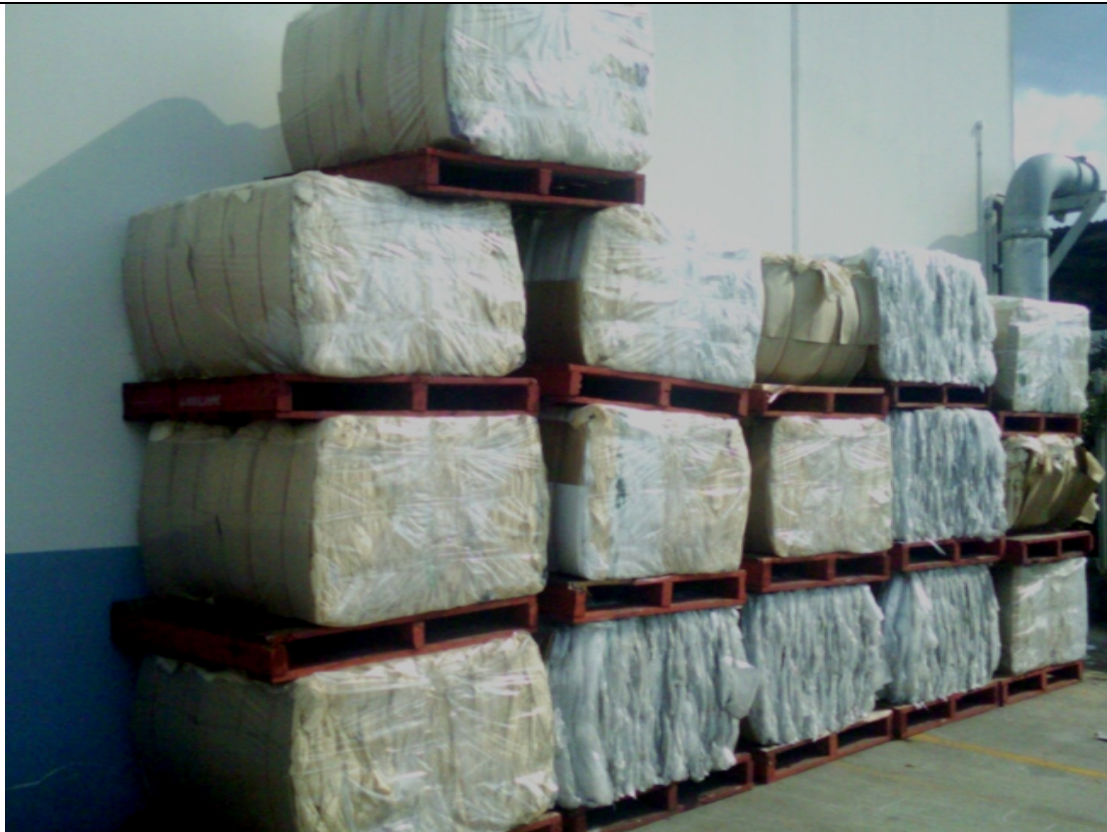
Films , board and waste paper are bundled ready for recycling collection