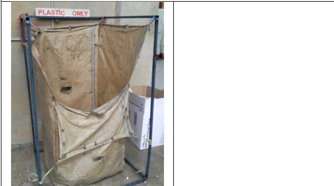
Waste film collection bin