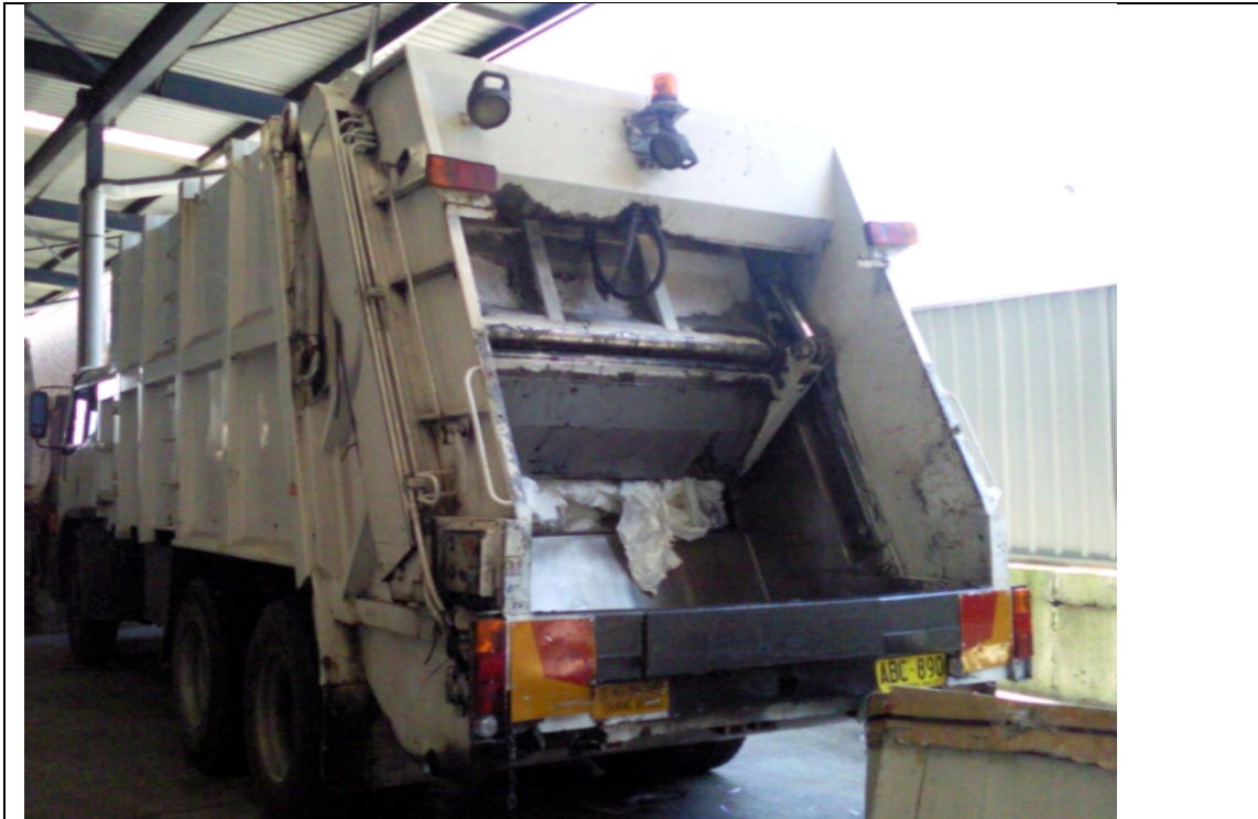
Our recycling truck which collects waste paper for the mill